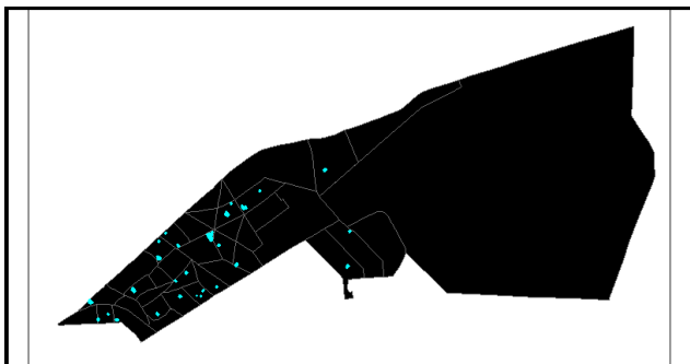
Figure 3: a distribution map for the hospitals in Masr El-Gdeda

According to figure 2, it's a location map for a specific area in Cairo which is Masr-Elgdeda presented on a Cloud based GIS which is the ArcGIS online. As it's shown on the map, it's an empty map without distribution for any objects on it.